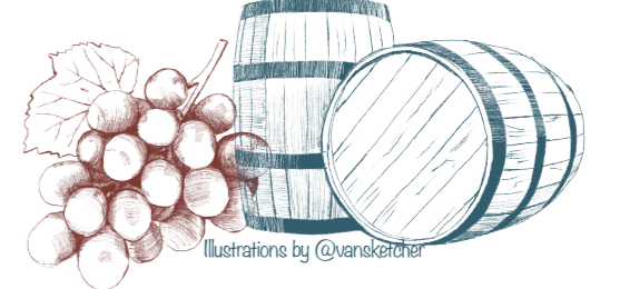
Illustrations by @vanskerckel

Discover our curated wine collection 13 countries across 5 continents Allow our team to guide you on a journey around the world